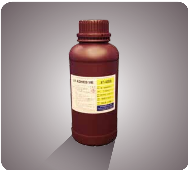
· Commercial Type (UV Lamp, LED )

LCD Glass sealant for Display(LCD, OLED) Etching Industry