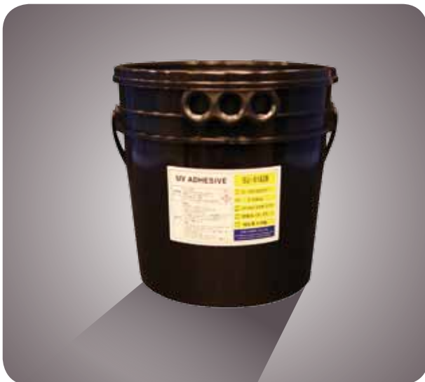
· Commercial Type (UV Lamp, LED )

To protect scratch of glass surface for Display Industry